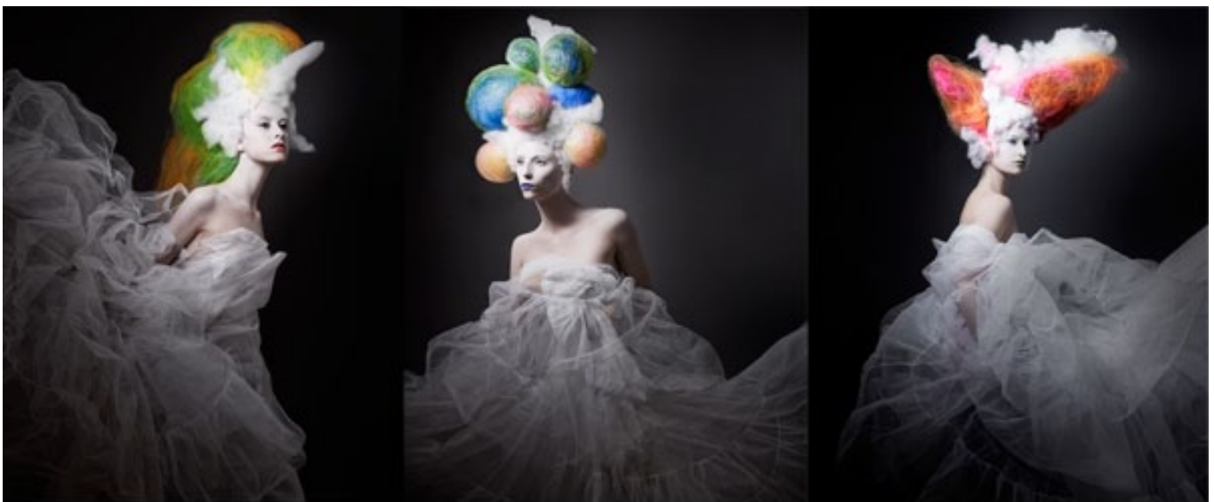
2010 NAHA FINALIST : AVANT GARDE