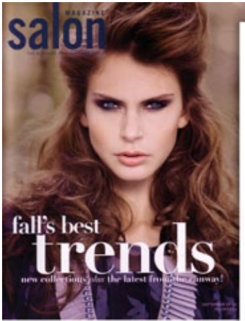
COVER : SALON MAGAZINE